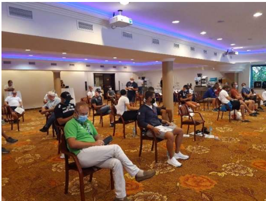
Team Captains Meeting