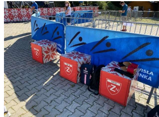
Exit gate area