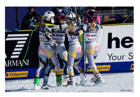
Nations Team Event