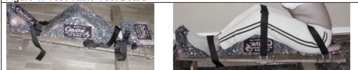
Figure 1: Test-Table-Test Board